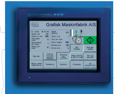
Easy to use touch screen